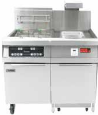
Model SCFM1CFE shown with optional heat lamp and cafeteria pan.