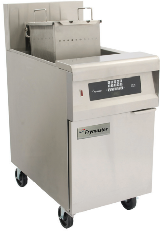
GPC Shown with optional casters